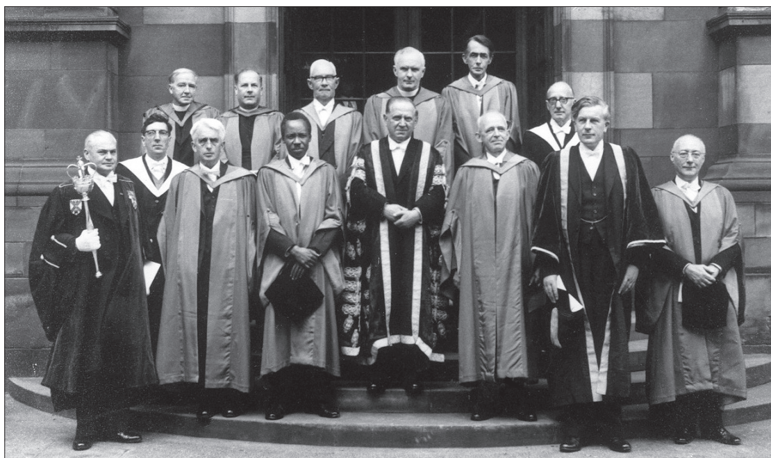
1962, Nyerere receiving his honorary second degree from the University of Edinburgh.