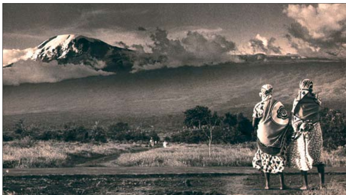
Julius Nyerere’s independence struggle was based on his vision for the country

Mwalimu believed in non-violence to achieve his goals, but he was not sure whether his commitment to wage the struggle for independence by peaceful means would convince the people of Tanganyika