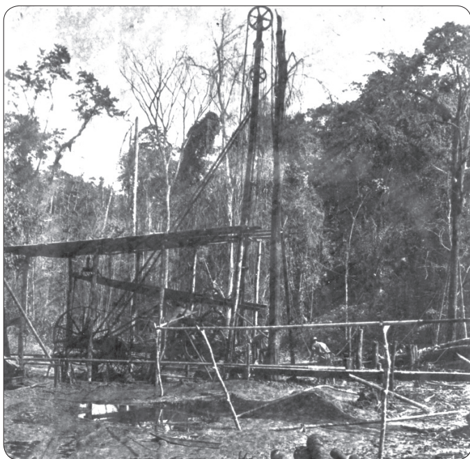
One of the Caribbean's earliest oil wells, Trinidad, 1866

Guyana, Suriname's next door neighbour, with whom it had a long-standing maritime boundary dispute, mainly triggered by expectations of oil discoveries, but which is now settled, is also