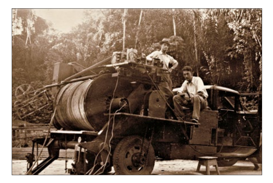
Figure 1: Intrepid oil pioneers make their first tracks in the sands of Trinidad

forth between Venezuela and Trinidad to attend to jobs for a year before the first permanent base was established in San Fernando, the island's southern city. But once the company formally set up shop in Trinidad it was there to stay. By 1935, five engineers were active in the country.