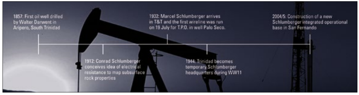
Figure 6: Time-line showing Schlumberger's milestones of progress in Trinidad