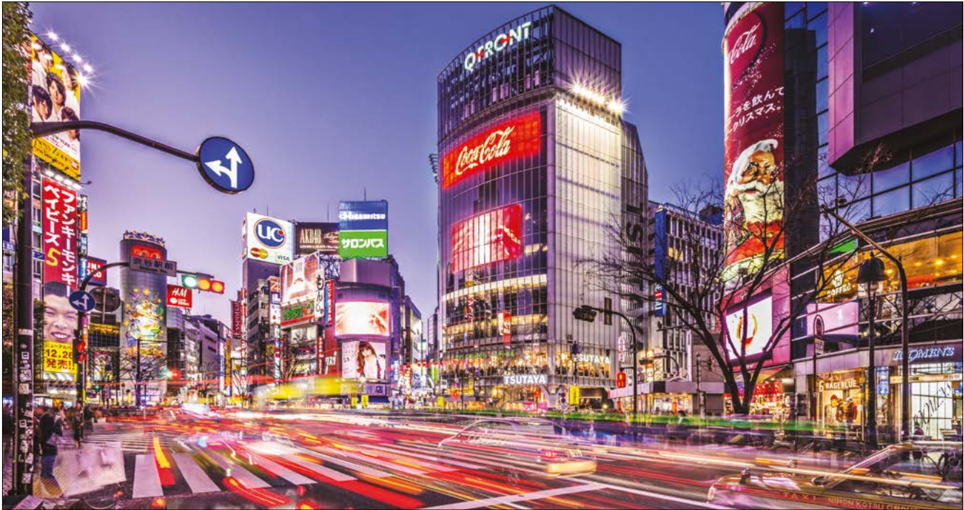
APEC members share a common interest in ensuring future energy security, supporting a high quality of life for citizens.

to timely, accurate and reliable data supports sound and informed decision making in relation to the oil market. In 2012, JODI-Gas was permanently established for greater natural gas data transparency.