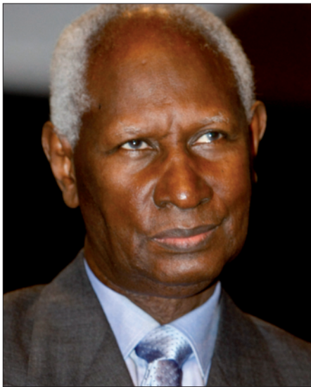
Message from HE Abdou Diouf Secretary General of La Francophonie

The theme of this year's Commonwealth Heads of Government Meeting in Trinidad and Tobago: 'Partnering for a More Equitable and Sustainable Future' coincides fully with the concerns of La Francophonie, which has also made sustainable and equitably shared development the focus of its missions. The challenge is enormous. It calls for active solidarity and innovative partnering, notably with organisations belonging to other linguistic and cultural groups.