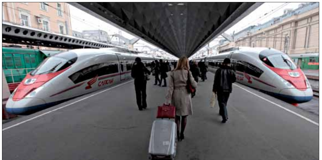
Advanced transport infrastructure is key to the modernisation of the Russian economy

The RF CCI promotes the adjustment of laws in correspondence with economic realities. It appraises key bills presented to the State Duma and makes related proposals. For instance, we have recently made proposals concerning the draft law "On State Support to Innovations in the Russian Federation." We have also made proposals and comment on the alternations of the Customs Code of the Customs Union of Russia, Belarus and Kazakhstan. Our current priority is the soonest adoption of the Federal Law "On Industrial Policy." We think this is one of