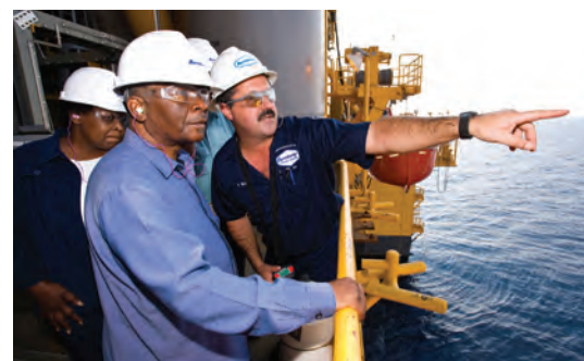
His Excellency Armando Emilio Guebuza, President of Mozambique visits Anadarko's Independence Hub floating production facility in the Gulf of Mexico.

As a result of these discoveries, Anadarko and its partners are working to advance an onshore commercial LNG development near Palma that will initially consist of two 5-million-tonne-per-annum liquefaction trains, with the expectation of adding additional liquefaction trains in future years. The Prosperidade field is unquestionably one of the world's most important natural gas discoveries in the last decade, and developing it will likely require the largest foreign investment in Mozambique's history, exceeding the country's total current GDP.