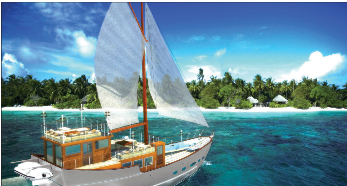
Soneva in Aqua is a pioneering new boat villa concept

We have developed resorts in many countries and the Maldives ranks among the best in terms of government responsiveness