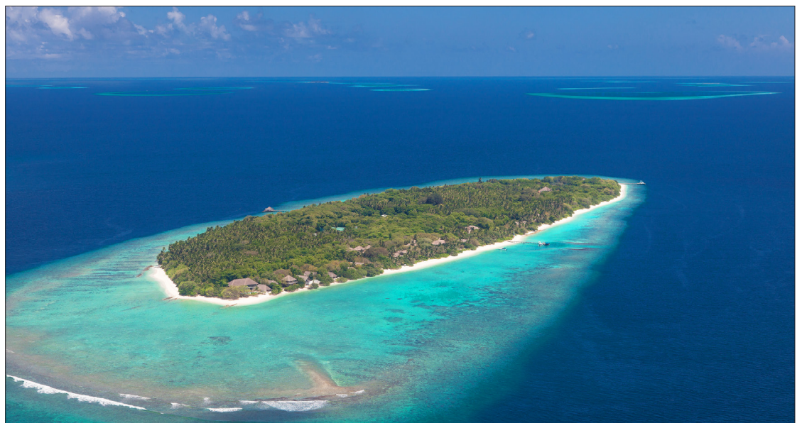
The Soneva Fushi Resort is the original desert island hideaway in the Maldives

We have been dealing with government for the last 20 years, and we are extremely impressed by how clear