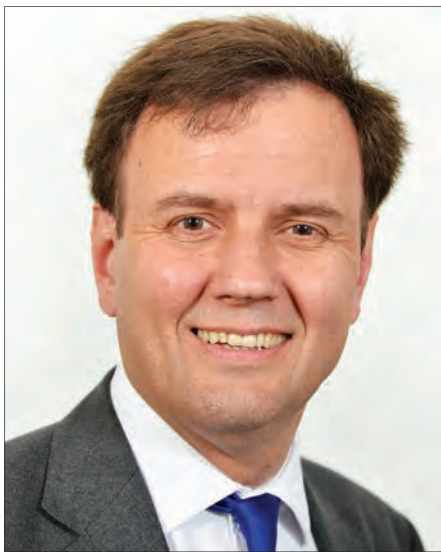
Message by Rt. Hon. Greg Hands MP Minister of State for Trade and Investment Department for International Trade

It gives me great pleasure to welcome you to the UK Pavilion at the Astana Expo. This Pavilion is a symbol of UK creativity, showcasing British inventions throughout history. From steam locomotion to graphene - the strongest, thinnest and most permeable material that we've ever discovered – one can find examples of how UK innovation has always sought to push boundaries and shape the way we live.