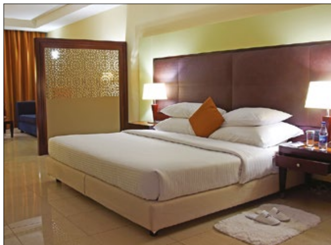
An executive room of the Corinthia Hotel in Khartoum

As well as providing greater space, the Ministerial Suites offer a range of luxury amenities such as a king-size bed, marble bathrooms and jacuzzi, an expansive living area, dining table and working desk and a two-seater sofa. Ministerial Suite guests are offered complimentary airport