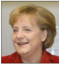
ANGELA MERKEL Germany

“There was a multilateral response aimed at resolving the great challenge of 2007 and 2008, the international financial crisis. This response took the form of meetings between the Heads of State and Government of the G20, whose Presidency is held by Argentina this year. Germany held the Presidency last year and the motto of our Presidency was “shaping an interconnected world”. We tried to foster global cooperation in what is not a particularly easy time. We made progress in global cooperation in the health sector, the partnership with Africa and the global steel forum, which addresses dumping and fair trade. We tried to strengthen the role of multilateral organisations and sought to promote an open global trade system.”