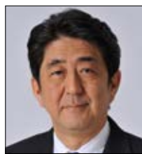
SHINZO ABE Japan

“I appreciate the efforts of OECD and G20 countries in overcoming Base Erosion Profit Shifting (BEPS), facilitating Automatic Exchange of Information (AEOI), and implementing Multilateral Instrument (MLI). We should ensure that AEOI can return taxpayer’s obligations to its countries and ensure that the exchange of data will provide benefits.”