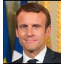
EMMANUEL MACRON , France

“An important part of what we’re doing at the G20 has to do with the major goal we have in Argentina: to reduce poverty. Our vision is for the G20 to be a group of countries that cooperate to generate inclusive growth. In light of this, we have decided on the slogan for our presidency: “Building consensus for fair and sustainable development.” We lead the G20 based on the principle of putting people first, with a focus on equality and sustainability.