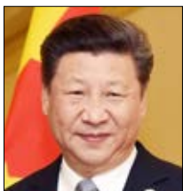
XI JINPING China

“Mexico attends these meetings with a sense of responsibility. We reiterate the commitments we have made as a nation, precisely in favour of protecting and caring for the environment. We believe that the digital age and the use of digital technologies opens up spaces of opportunity to achieve greater social inclusion, facilitate entrepreneurship, and enable the new generations to be incorporated into the productive era, precisely through the use of information technologies”