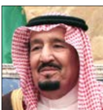
KING SALMAN Saudi Arabia

“The UK is a leading advocate for free trade and open markets, for the World Trade Organisation, and for a global economy that works for everyone. But it is also important that we acknowledge some people feel left behind by globalisation, and that not all countries are playing by the rules. I have encouraged leaders to take steps to make the international trading system work better, to ensure that all our citizens can share in the benefits of the global economy.”