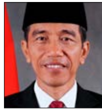
JOKO WIDODO Indonesia

“As opposed to globalisation, the forces of protectionism are emerging. Their intent is to not only safeguard themselves from globalisation, but also to alter the natural flow of globalization. One of its result is that we are witnessing new types of tariff and non-tariff barriers. Bilateral and multilateral trade agreements and negotiations seems to have been stalled. Cross-border financial investment has decreased in most countries. And the growth of global supply chains has also stopped. The solution to this worrisome situation against globalisation is not in isolation. Its solution lies in understanding and accepting the change, it lies in making smart and flexible policies with the changing times.”