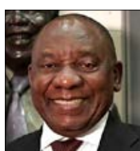
CYRIL RAMAPHOSA South Africa

“Addressing climate change, marine pollution, and disaster risk reduction are critical pillars for achieving the UN’s Sustainable Development Goals. Japan will preside over the G20 next year and focus on accelerating the virtuous cycle of environmental protection and economic growth. When the seventh Tokyo International Conference on African Development is held in Japan, we will extend support to African countries. We invite the rest of the world to join us in tackling this tough challenge.”