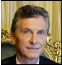
MAURICIO MACRI Argentina

“An important part of what we’re doing at the G20 has to do with the major goal we have in Argentina: to reduce poverty. Our vision is for the G20 to be a group of countries that cooperate to generate inclusive growth. In light of this, we have decided on the slogan for our presidency: “Building consensus for fair and sustainable development.” We lead the G20 based on the principle of putting people first, with a focus on equality and sustainability.