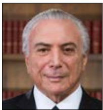
MICHEL TEMER Brazil

“There was a multilateral response aimed at resolving the great challenge of 2007 and 2008, the international financial crisis. This response took the form of meetings between the Heads of State and Government of the G20, whose Presidency is held by Argentina this year. Germany held the Presidency last year and the motto of our Presidency was “shaping an interconnected world”. We tried to foster global cooperation in what is not a particularly easy time. We made progress in global cooperation in the health sector, the partnership with Africa and the global steel forum, which addresses dumping and fair trade. We tried to strengthen the role of multilateral organisations and sought to promote an open global trade system.”