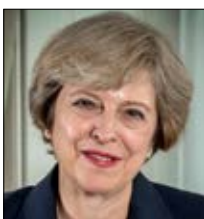
THERESA MAY United Kingdom

“Shared responsibility, in the framework of building peaceful, equitable and sustainable societies, is a call that we share and accept as an invitation to change: the same spirit of change that characterizes the action of the Government that I lead”