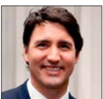
JUSTIN TRUDEAU Canada

“We reached an agreement to do our best so as to render global financial safety nets more effective and flexible. We expressed support for the formation of an IMF structure that has a strong, quota-based and adequate financial resource as well as a more effective lending toolkit.”