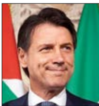
GIUSEPPE CONTE Italy

“It should be recognised that, despite our collective efforts, the global economy still has lower economic growth than what was seen before the global crisis that began in 2008. I want to mention that three elements have deserved our special attention. First, the evolution of commodity prices. Second, the effects on the markets of monetary policies of some developed countries. And third, the volatility of financial markets - amidst factors such as high instability in geopolitically-sensitive regions of the planet and terrorism.”