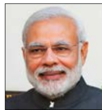
NARENDRA MODI India

“When the United States grows, so does the world. American prosperity has created countless jobs all around the globe, and the drive for excellence, creativity, and innovation in the U.S. has led to important discoveries that help people everywhere live more prosperous and far healthier lives. As the United States pursues domestic reforms to unleash jobs and growth, we are also working to reform the international trading system so that it promotes broadly shared prosperity and rewards to those who play by the rules.”