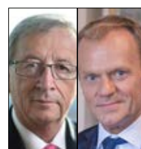
JEAN-CLAUDE JUNCKER & DONALD TUSK , European Union

“As our planet becomes increasingly interconnected, we need to promote strong, sustainable economic growth that works for everyone, and embrace the need to be socially and environmentally responsible. This is about creating jobs and opportunities for everyone, and building a healthier and more prosperous tomorrow for our children and grandchildren.”