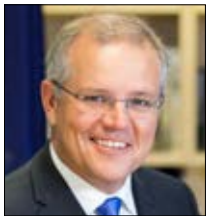
SCOTT MORRISON Australia

“In order to defeat inequalities, we must change approach and scale. First of all, revise both our trading and social rules; rather than pursuing protectionism, we must all work together to radically revise the WTO rules. We must restore the WTO’s ability to resolve conflicts, enact rules to deal with unfair trade practices, non-respect for intellectual property and forced technology transfers, which no longer allow for a fair fight. This year, the G20 in Argentina must give us a credible road map for radically reforming the WTO.”