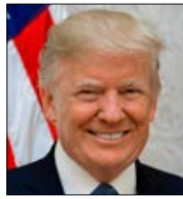
DONALD TRUMP United States

“The Kingdom also participated in the G20 Summit, a step reflecting the prestigious and important position of our country in the map of the global economy. During this summit, the Kingdom has contributed to develop economic relations among the countries, overcome the obstacles and constraints and encourage and support the flow of investments, exchange of the expertise, technology transfer and cooperation in all fields for the benefit and interest of all.”