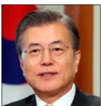
MOON JAE-IN South Korea

“G20 is primarily an economic forum, even though many political and similar issues emerge. Nevertheless, the main issue is the development of the global economy. Overall, this forum is definitely effective, and I believe it will play a role in stabilising the global economy in general.”