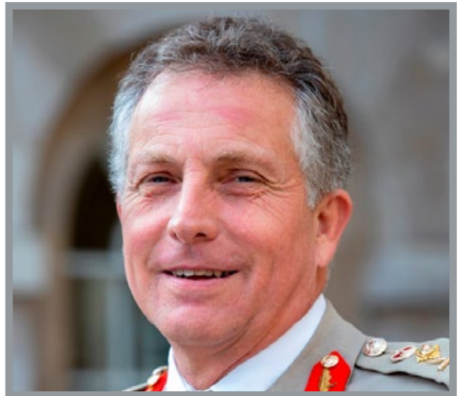
General Sir Nick Carter KCB CBE DSO ADC GEN Chief of Defence Staff

H is late Majesty Sultan Qaboos was a leader respected across the world and will be remembered by the United Kingdom and within Defence and the UK Armed Forces as a true and greatly valued friend. We will sorely miss his sage advice and experience of charting the waters of a region that has experienced more than its fair share of challenges and crises.