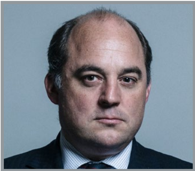
The Rt Hon Ben Wallace MP Secretary of State for Defence