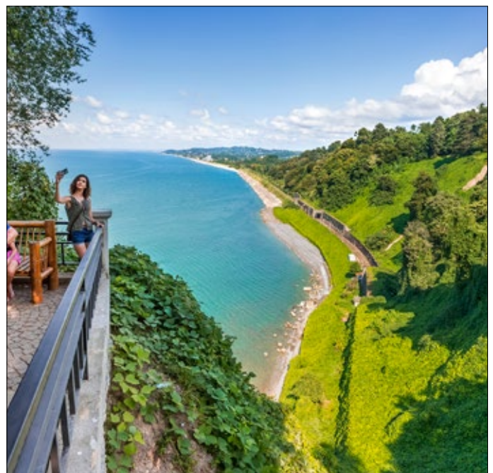
Above: Batumi Botanical Garden is located above the Black Sea, 9km from Batumi city centre, and boasts a wide variety of flora