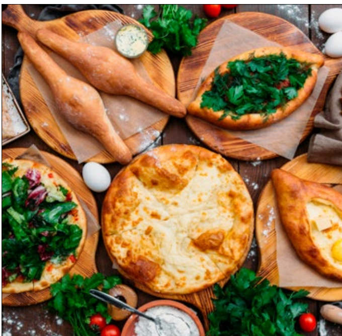
Above: Khachapuri is a popular traditional Georgian cheese bread, both in restaurants and as a street food