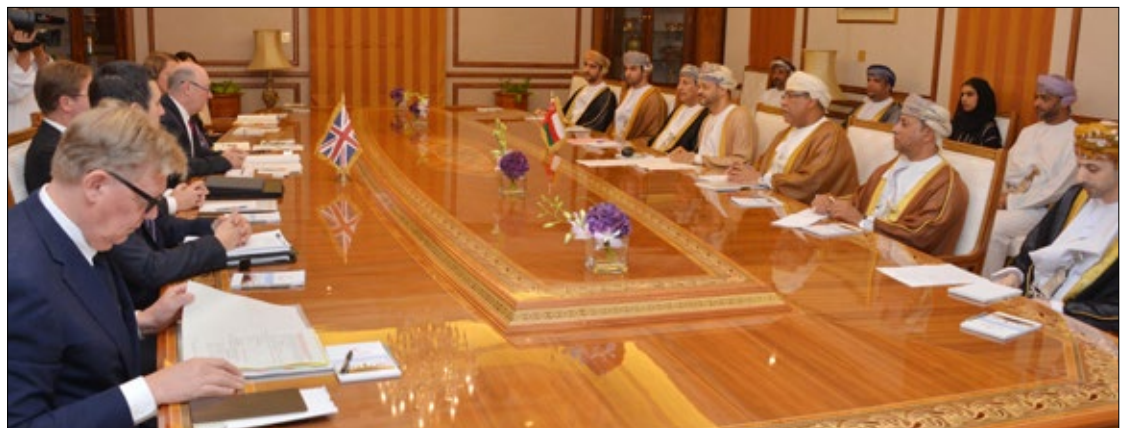
A meeting of the Omani-British working group

The NSSG is playing a seminal role in Oman’s Digitisation strategy, through National workshops and working along with other national stakeholders to identify ways and means to address challenges through a collective effort delivered through various programs (i.e Tanfeeth). We are proud to witness the speed of the results of all efforts which have been worked hard on. In 2018, Oman ranked third globally (behind the USA and Canada) for “countries best prepared for cyber attacks”. This demonstrates the level of sophistication Oman possesses, and our aim is to share our experiences with our international partners and clients to help them narrow down their cybersecurity challenges. E